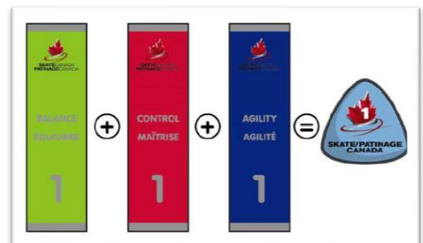
Example of Level 1 CanSkate Ribbons and Badges